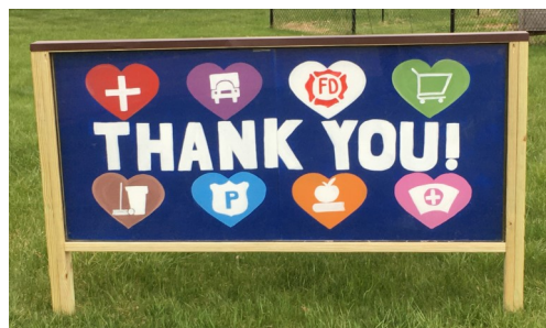
Community Support Sign

This team has been crucial to our community in the last year. Thanks to them all and their continued service.