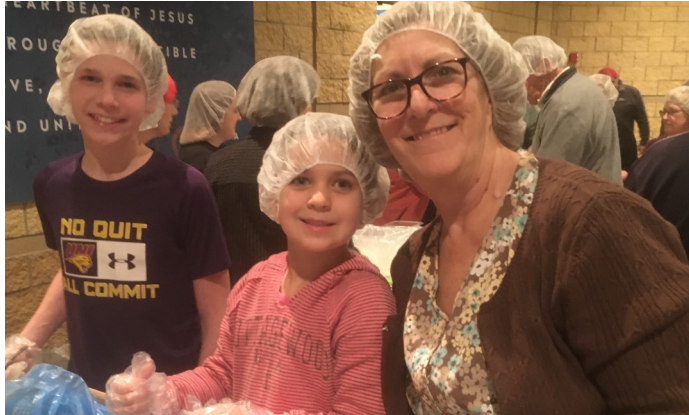
Feed My Starving Children

We will make a difference in the world in Christ's name bringing about change in our lives and community.