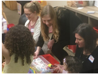
Play and Praise