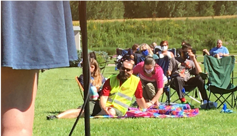
Summer Outdoor Worship

We will gather together to grow through worship, learning, stewardship, prayer, and action in the world.