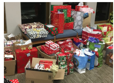
Trinity Care Center Gifts