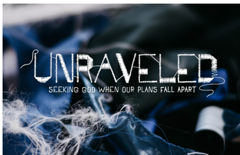
Summer Worship Series