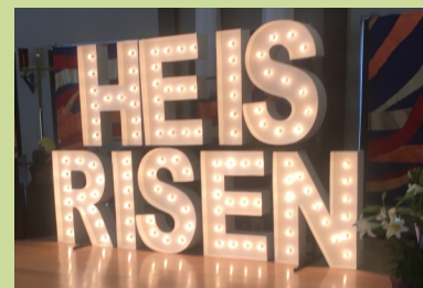
Easter Worship Sign